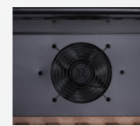
AIR CIRCULATION FAN