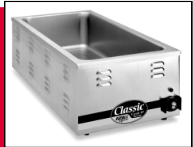
MODEL CW-3A COUNTERTOP COOKER